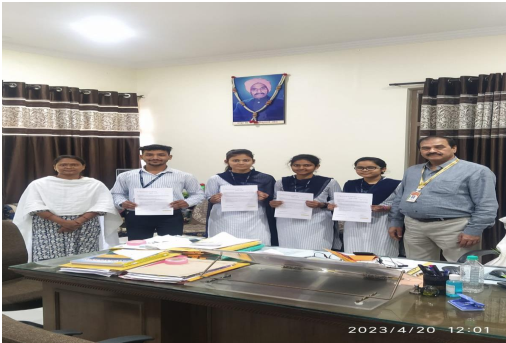
Selected students with intent letter provided by The Kiran Academy ,Pune