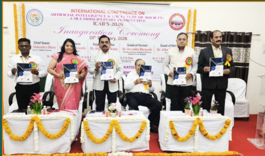
International Conference on "Artificial Intelligence & the Future of Society : Multidisciplinary Perspective"