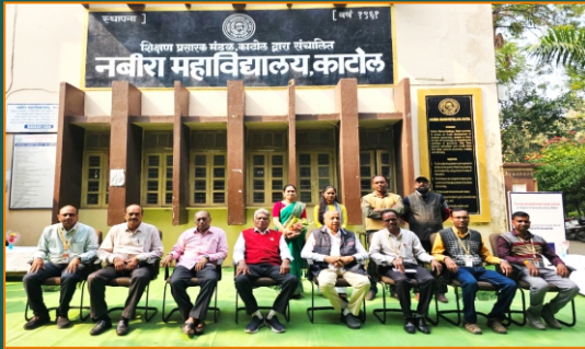
Felicitation Program of M. A. (History) Merit Students - 2025