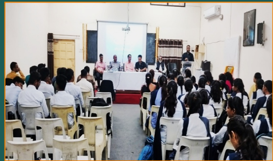
Student Recognition & Felicitation Program organized by the Dept. of Micro. / Biotech.