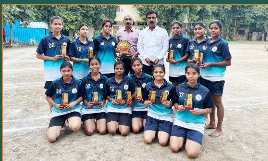
RTM Nagpur Univ. Colour Holders 2025-26