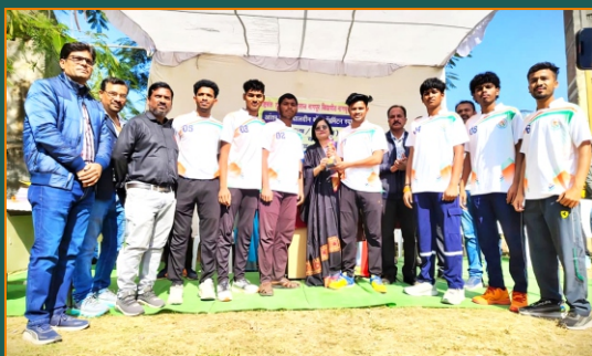
RTM Nagpur Univ. Ball Badminton Runner Team