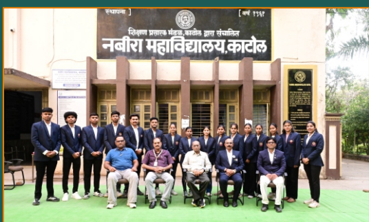
RTM Nagpur Univ. Colour Holders 2025-26