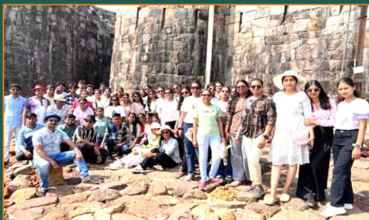
Educational Tour to Kokan organized by the Dept. of Chemistry