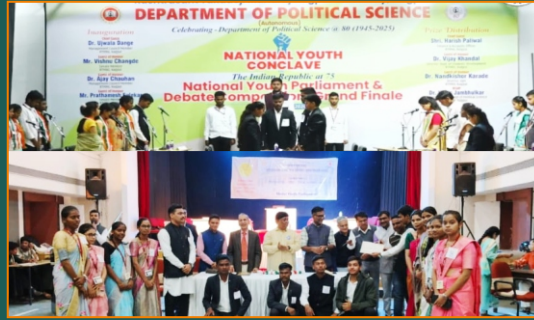
Student of Political Science Participated in "Youth Parliament Competition 2025 - 26"