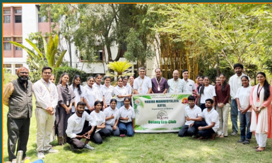
Eco-Club activity of Botany Dept.