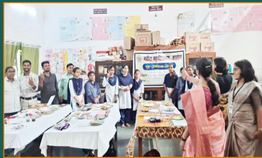
"Nutrition Week" Celebration by the Dept. of Home - Economics