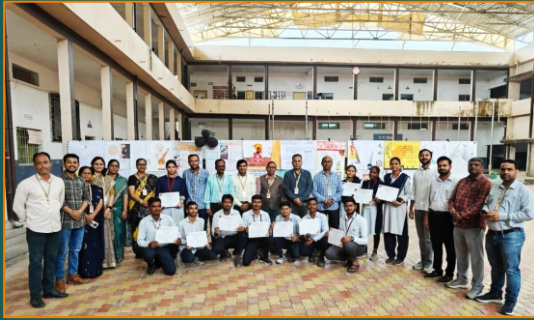
Poster Presentation Competition organized by the Dept. of Marathi to Celebrate "Marathi Bhasha Gaurav Din"