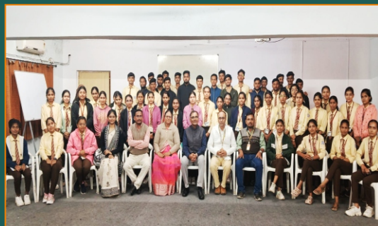
Guest Lecture on "Financial Market & Risk Associated With it" organized by B.B.A. Dept.