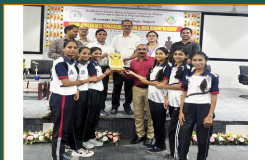
RTM Nagpur Univ. Yogasan Girls Winner Team (13 Times)