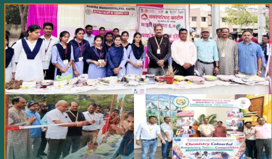
Ecofriendly Holi Colours : Green Initiative & Interpreneurship Venture, and Temporary Tattoo Competition organized by the Dept. of Chemistry.