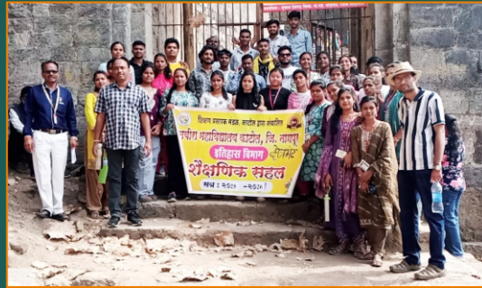
Educational Field Visit to Devgad Fort by the PG Dept. of History