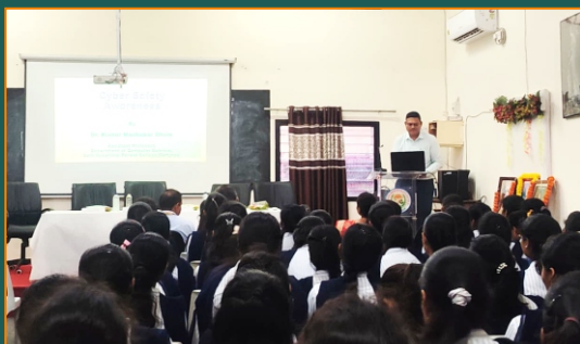
Workshop on "Cyber Safety Awareness" organized by the Dept. of Computer Sci.