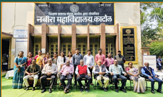
Felicitation Program of the Merit Students of Commerce