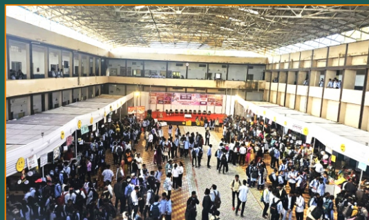
Trade Fair - 2026 organized by the Dept. of Commerce