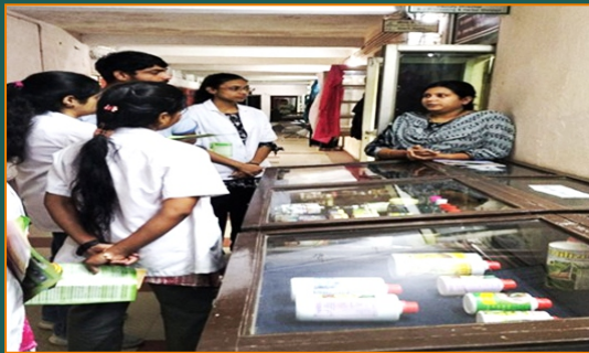
Educational Tour to MGRI Wardha organized by the Dept. of Micro. / Biotech.