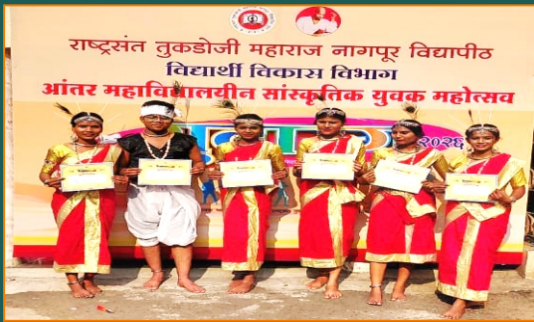
Participation of the Students in the Cultural activity organized by Student Development Dept. of RTMNU, Nagpur