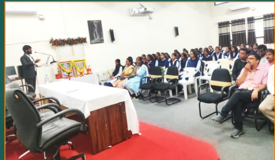
Workshop on "Integration of AI / ML in Robotics" organized by the Dept. of Physics.