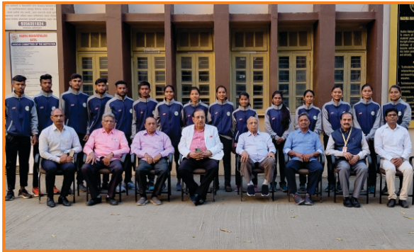
RTM Nagpur University Colour Holders (2022-23)