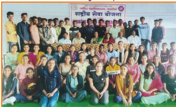
एन.एस.एस. शिबीरामध्ये सहभागी स्वयंसेवक २०२२-२३