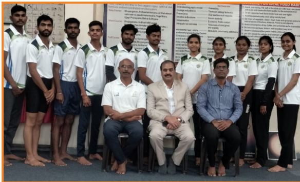
RTM Nagpur University Yogasan Mens' Winner & Women Runner Team (2022-23)