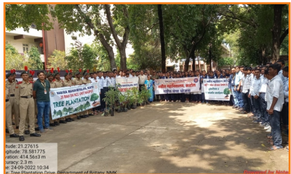
Tree Plantation Drive organized by Dept. of Botany & NCC Unit