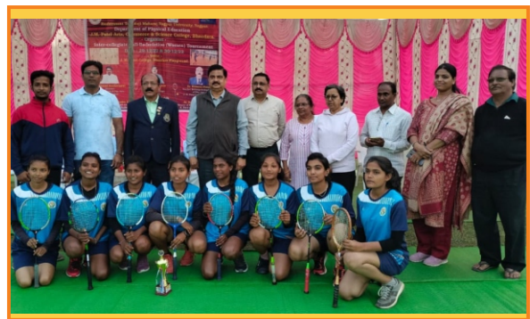
RTM Nagpur University Ball Badminton Womens' 7th time Winner Team (2022-23)