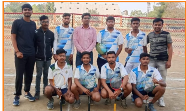
RTM Nagpur University Ball Badminton Mens' Winner Team (2022-23)