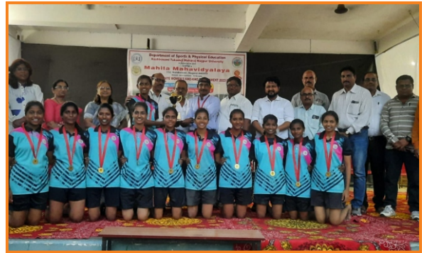
RTM Nagpur University Kho-Kho Womens' 10th Times Winner Team (2022-23)