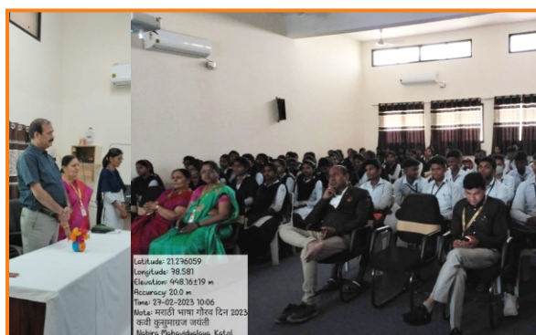
मराठी विभागातर्फे आयोजित मराठी भाषा गौरव दिन २०२३ व कवी कुसुमाग्रज जयंती