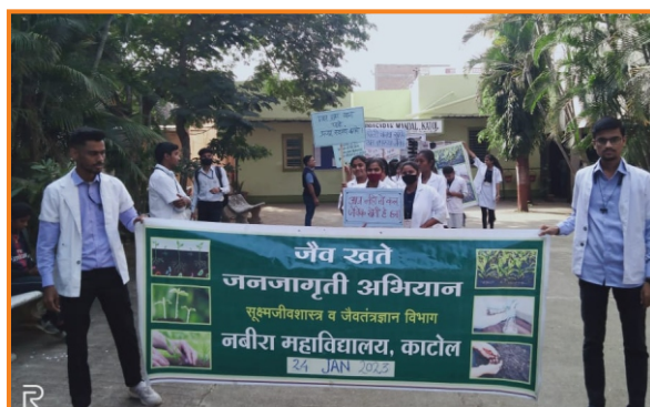
Bio-fertilizer awareness campaign organized by Deptt. of Microbiology & Biotechnology