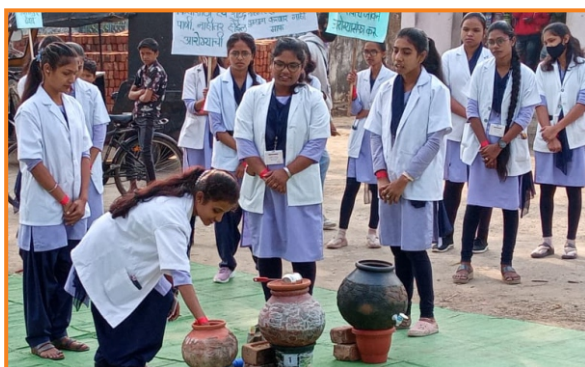
Pure Water Awareness Campaign organized by Deptt. of Microbiology & Biotechnology