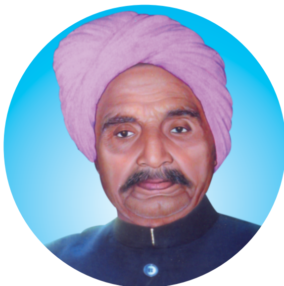
Late Shri Bhikulalji Nabira