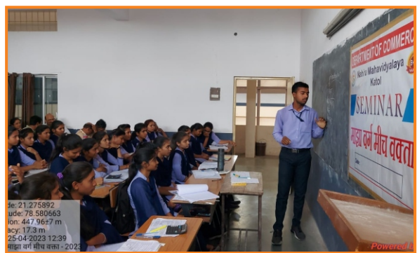
Seminar Organized by Department of Commerce