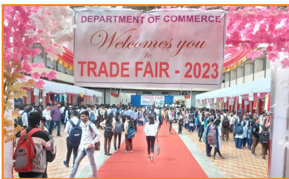
Trade Fair organized by Department of Commerce