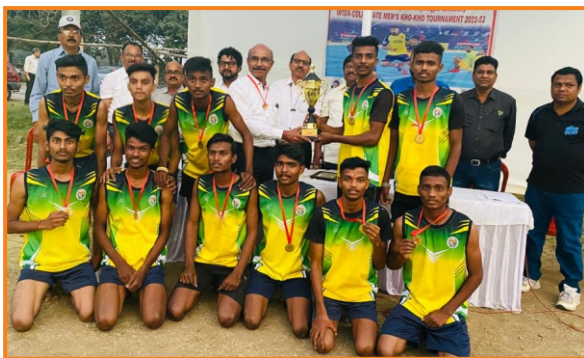
RTM Nagpur University Kho-Kho Mens' Runner Team (2022-23)