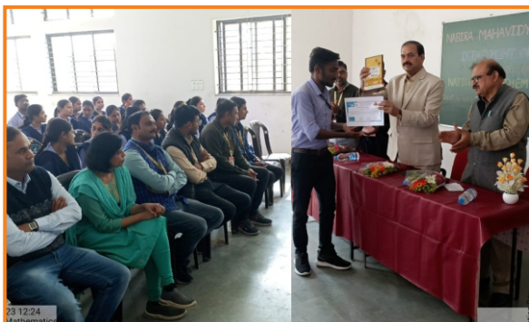
Prize Distribution Ceremony of "Intra-Collegiate Mathematics Seminar & Mathematical Rangoli Competition" - NMD-2022