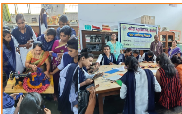
Door Mat & Rakhi making Workshop organized by Department of Home Economics