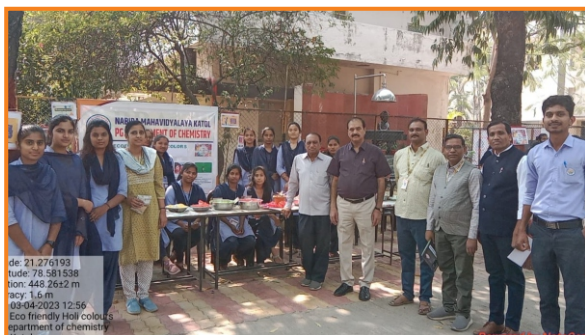
Eco-friendly Holy colors made by the PG Department of Chemistry