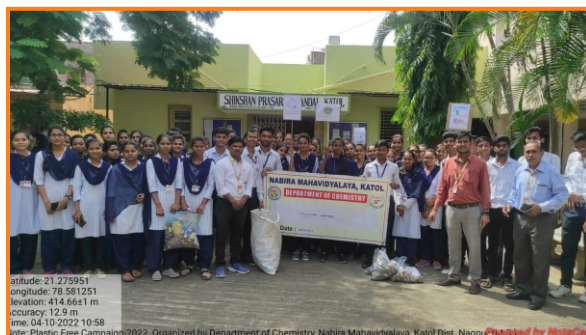
Plastic Free Campaign 2022 organized by Department of Chemistry