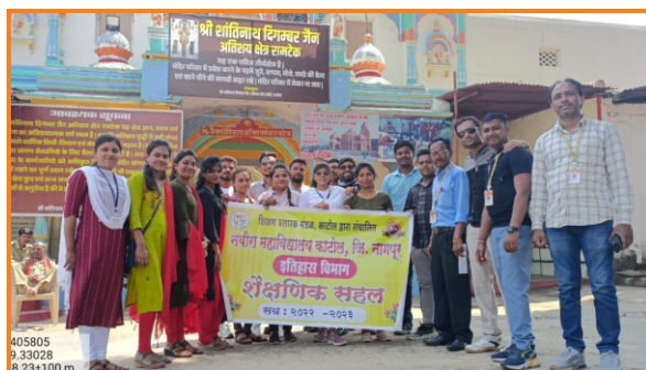
Educational Tour 2022-23 organized by Department of History