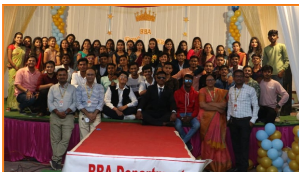
BBA Day Celebration by Department of BBA