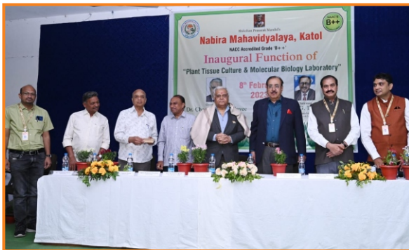
Inaugural Function of " Plant Tissue Culture & Molecular Biology Laboratory" organized by Dept. of Botany